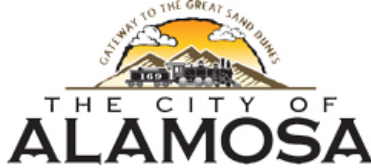
EXHIBIT F COUNCIL INITIATED AGENDA ITEM FORM