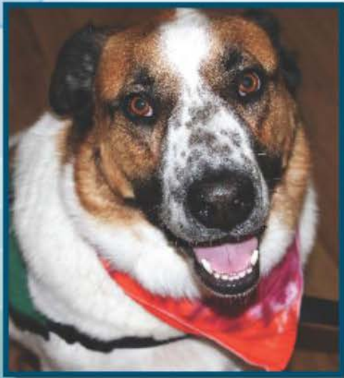
Moose is a registered therapy dog.

Moose loves listening to children read to him!